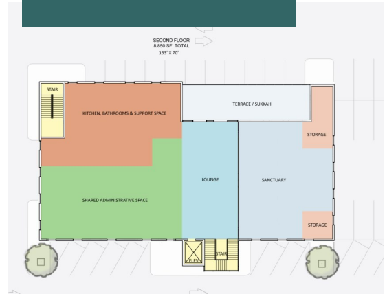
Layout of shared synagogue

The proposal will still need the approval of Temple Israel before it can be implemented.